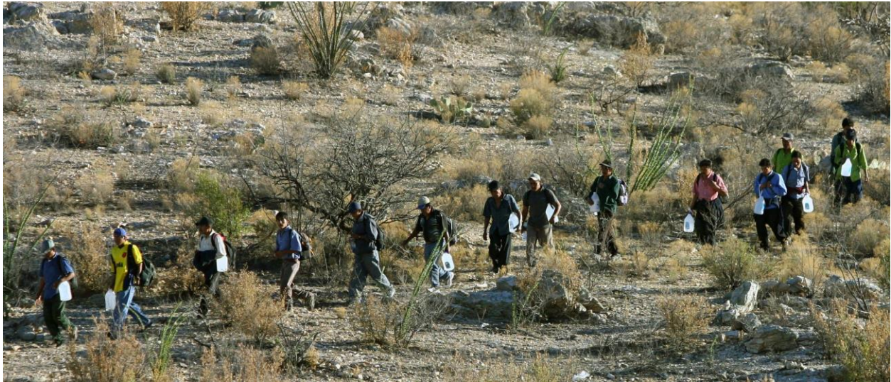
Mexican immigrants walk in line through the Arizona desert near Sasabe, Sonora state, in an attempt to illegally cross the Mexican – US border, 06 April 2006.

Mexico’s foreign minister Claudia Ruiz Massieu wrote Tuesday that she dreams of a world without walls, as her country braces for a wave of deported immigrants.