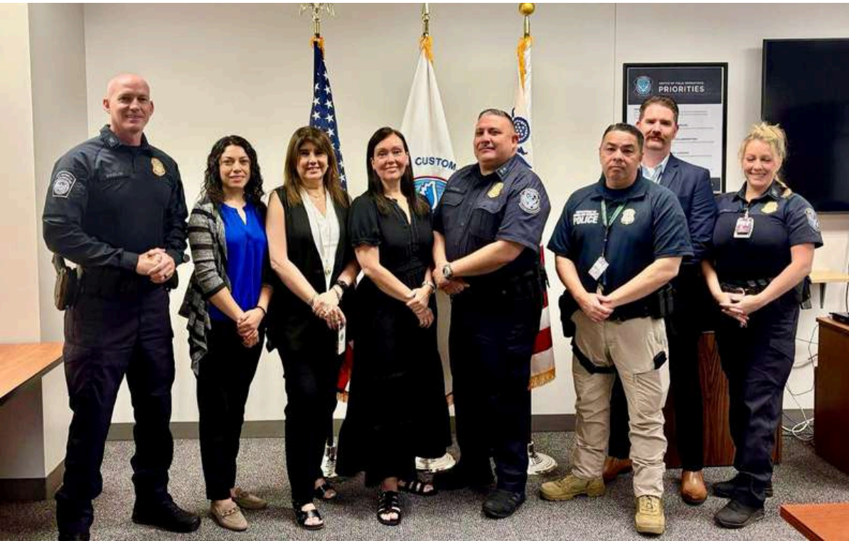
Photo: Meeting at Harry Reid International Airport with TSA, CBP, and HSI officials to address key issues in community protection in Nevada.